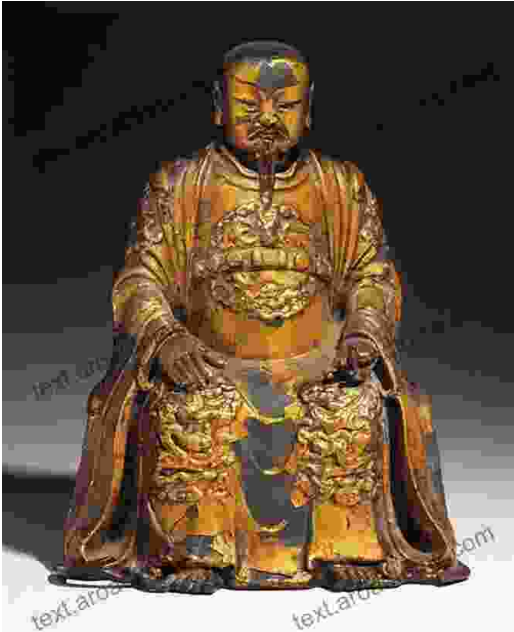
Zhenwu in the Ming Dynasty