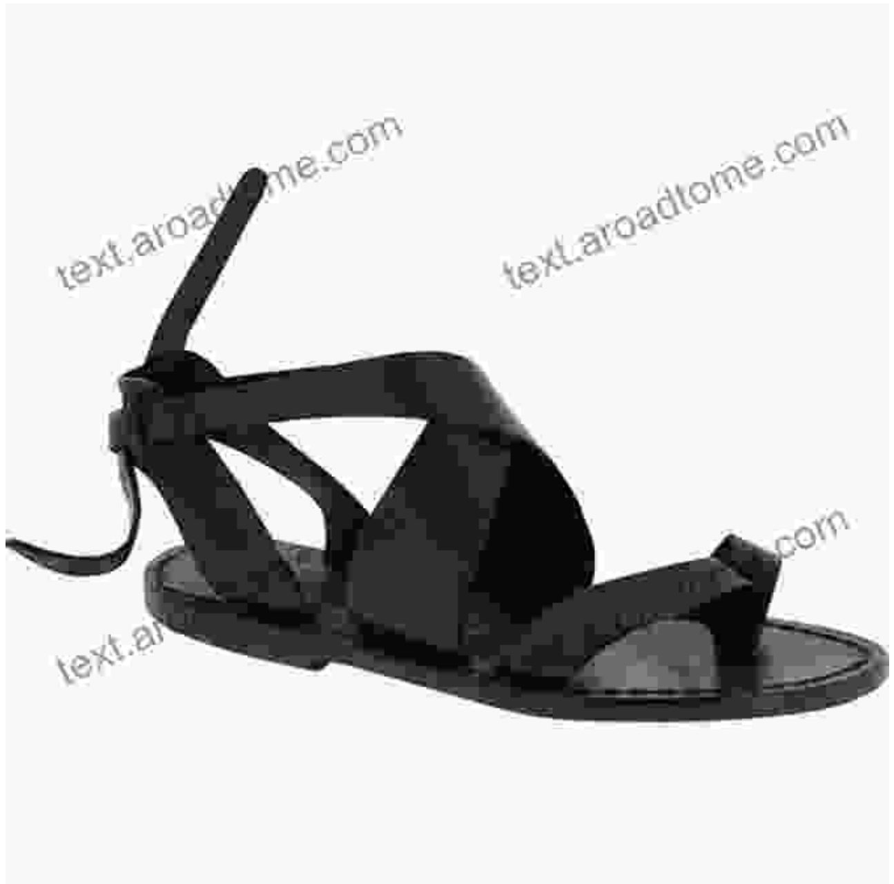
Margo Nash Women's Flat Leather Sandals

Don't wait any longer to experience the luxury and comfort of Margo Nash Footwear Sandals. Free Download your pair today and start turning heads wherever you go.