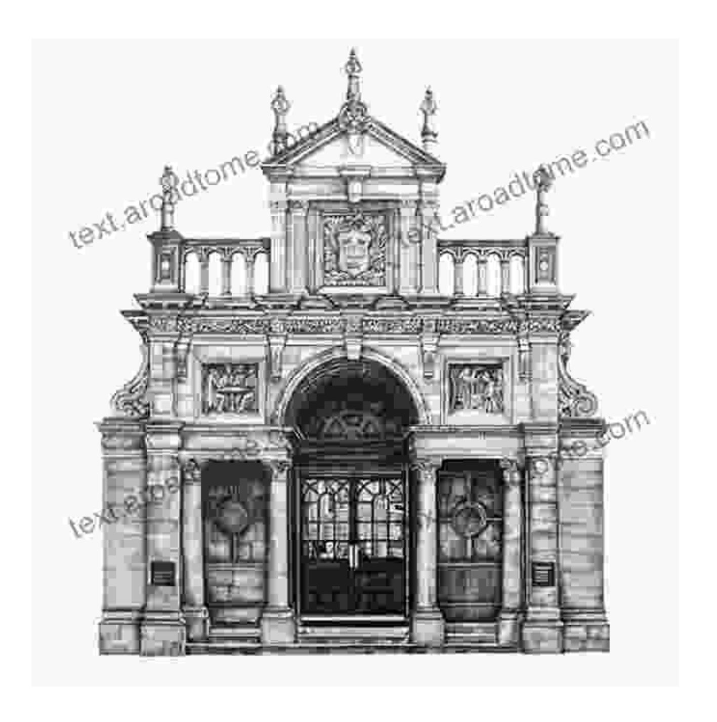
Unveiling the Techniques: A Masterclass in Architectural Drawing

Architectural sketches transcend mere technical drawings; they are works of art that capture the essence of buildings and spaces. They convey the architect's unique perspective, often revealing insights that cannot be fully expressed through traditional blueprints. In this book, renowned architects share their expertise, guiding readers through the nuances of sketching, from capturing proportions and perspectives to conveying texture and light.