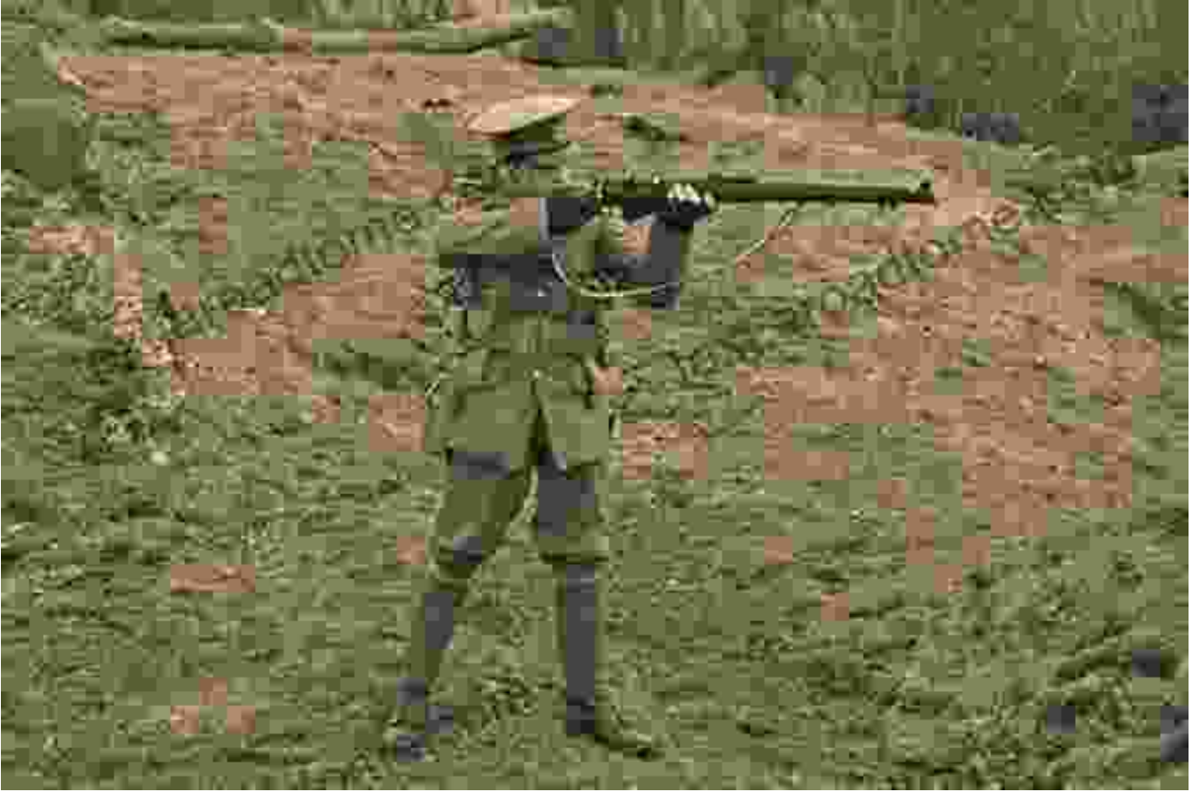
Figure 4: The tragic horrors of the Battle of the Somme

The Battle of the Somme was another major offensive launched by the Allies in 1916. It took place on the Western Front in northern France and was one of the largest and bloodiest battles of the war. The battle lasted for months and resulted in heavy casualties for both sides. The Allies made some gains, but they failed to break through the German lines. The battle ended in a stalemate, leaving both sides exhausted and disillusioned.