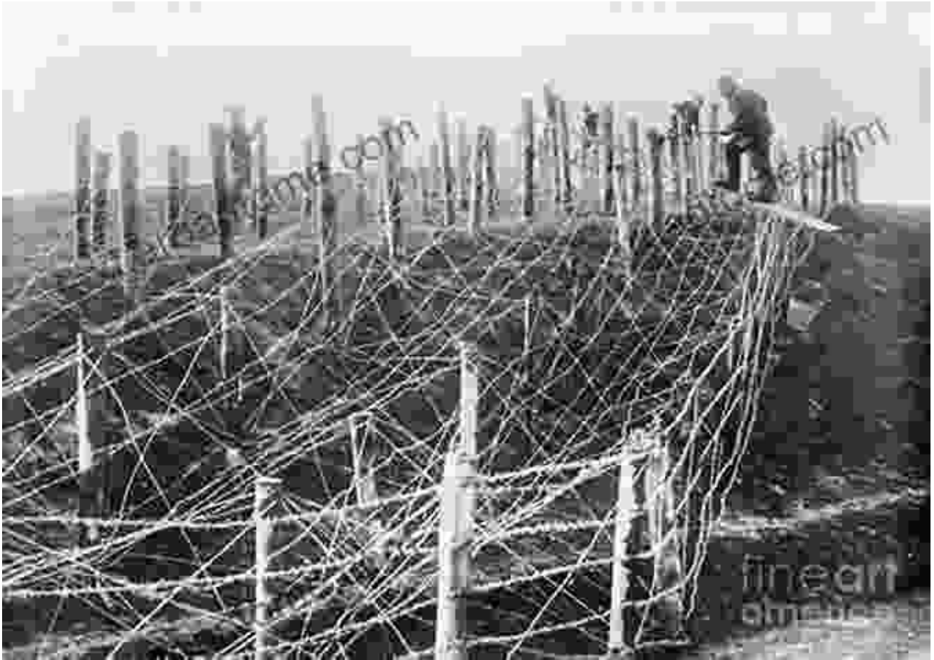
Figure 2: The grim conditions of the Battle of the Aisne

The Battle of the Aisne took place shortly after the Battle of the Marne. It was a series of fierce engagements that stretched along the Aisne River in northern France. The battle resulted in a stalemate, as neither side could gain a significant advantage. However, it did help to stabilize the Western Front and set the stage for the upcoming battles of Verdun and the Somme.