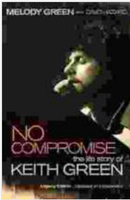
Image Alt Attribute: Keith Green performing live, with a passionate expression on his face, surrounded by an audience.

Whether you are a lifelong fan of Keith Green's music or seeking a deeper understanding of his extraordinary life, "No Compromise" is an essential read. Its pages are filled with insights, inspiration, and a challenge to live a life that is fully surrendered to God.