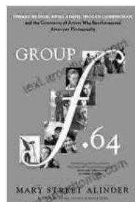
Group f.64: Edward Weston, Ansel Adams, Imogen Cunningham, and the Community of Artists Who Revolutionized American

Edward Weston's unwavering pursuit of artistic purity established him as a vanguard of 20th-century photography. Born in 1886, Weston found his calling in the medium's ability to distill the world's intricate beauty into stark, essential forms. His images of landscapes, nudes, and vegetables reveal a meticulous attention to detail and a mastery of composition.